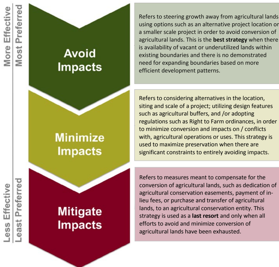
Figure 3. Hierarchy for Agricultural Land Preservation Strategies

LAFCo's unique mandates to preserve prime agricultural lands and discourage urban sprawl, and the fact that agricultural lands are a finite and irreplaceable resource, make it essential to avoid adversely impacting agricultural lands in the first place.